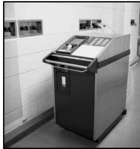
Figure 2. VHP Inlet/Outlet Ports

All rooms contain at least one pair of inlet/outlet ports to deliver and return hydrogen peroxide vapor (Figure 2). More than one pair of inlet/outlet ports were installed on some of the larger volume