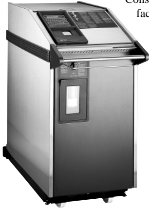
Figure 1. VHP 1000 Mobile Biodecontamination System

The animal rooms, as well as equipment and animal cages, periodically require decontamination, especially before housing a new group of animals or in the event of suspected contamination. The rooms have been designed and constructed to use a VHP 1000 Biodecontamination System (Figure 1).